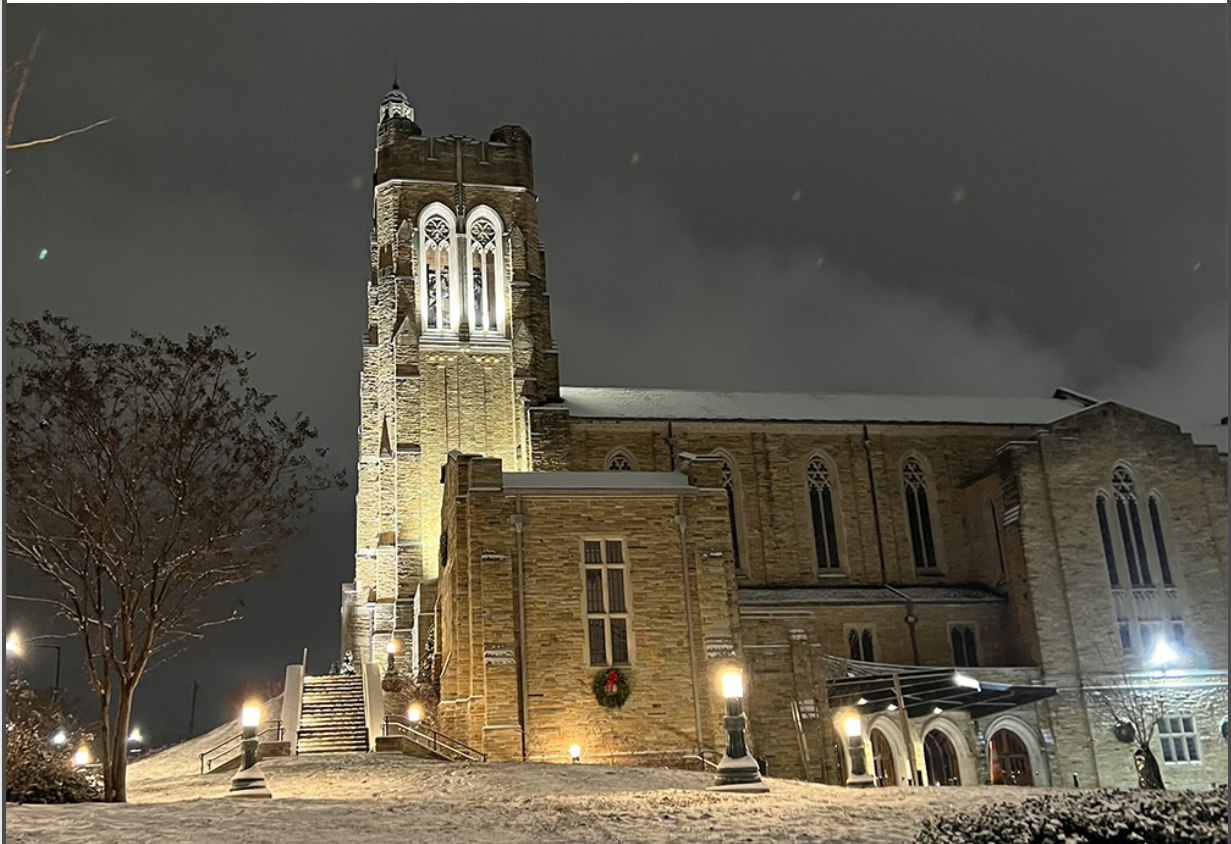
PHOTO OF THE WEEK: Two weeks ago, snowfall hushed the city the day after Christmas. Church Street had a beautiful blanket of snow as well, captured by Kylie Irvine, Church Street's Digital Media Specialist.