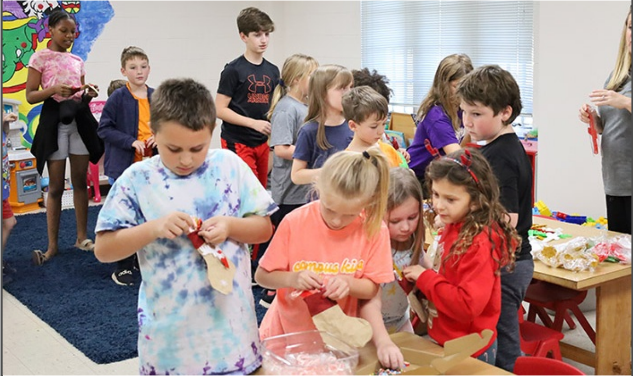
PHOTO OF THE WEEK: Children participating in our Sunday evening kids' time spent an hour or so packing stockings for the Kindergarten students at Dogwood Elementary School as a special holiday treat! The stockings include sweet treats, pencils and erasers, stickers, and pop-it bracelets!