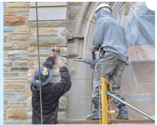
Workers carefully set the decorative limestone pieces.

Make plans now to join us on Sunday, November 11 at 10:30 a.m. Get a peek at what's to come at the Grand (Pre)-Opening Celebration