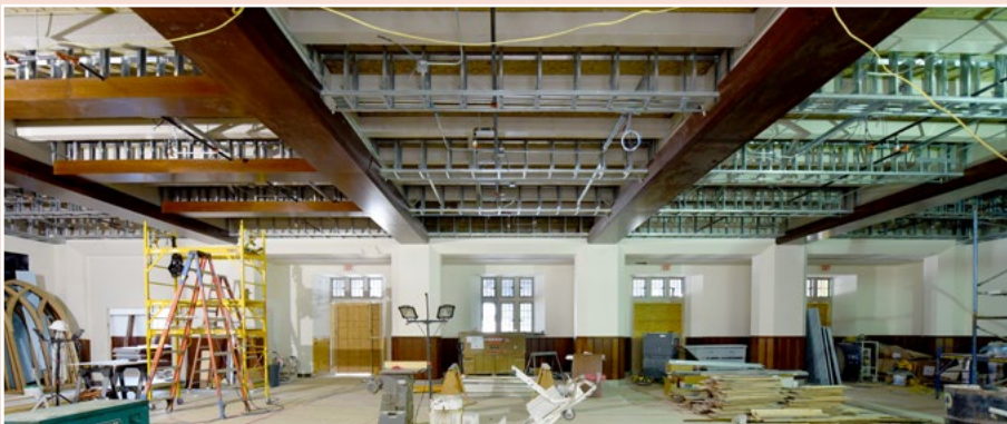
Supporting crossbeams are painstakingly wrapped in beautifully stained oak hardwood.

You may make a gift or pledge to the Building for Christ project today by contacting Kate Spencer at kspencer@churchstreetumc.org .