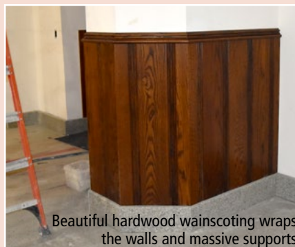
Beautiful hardwood wainscoting wraps the walls and massive supports