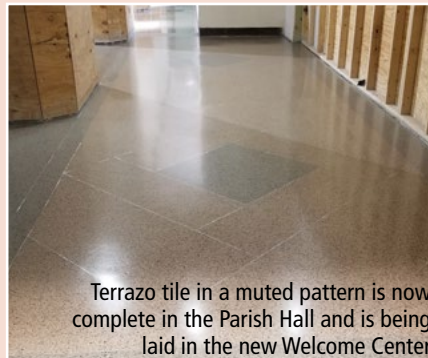
Terrazzo tile in a muted pattern is now complete in the Parish Hall and is being laid in the new Welcome Center

You may make a gift or pledge to the Building for Christ project today by contacting Kate Spencer at kspencer@churchstreetumc.org .