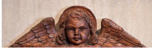
The Hymn Board Angel shares a look of censure.

I.P. Martin described the scene in East Tennessee in 1866: "It was possible to enumerate the casualties of war in dead and wounded, and to compute the destruction of property in every part of the land; but who could compute the moral casualties and spiritual losses of war? Hatred, fear, mistrust, cruelty, loss of confidence, and the crushing of sympathy were worse than anything wrought on the battlefield or by the fire of incendiary. No institution, social, civil, or religious, had escaped the devastating touch of war. In few places had greater havoc been wrought than in East Tennessee and in East Tennessee, no other church had been so deeply wounded as the Methodist Church."