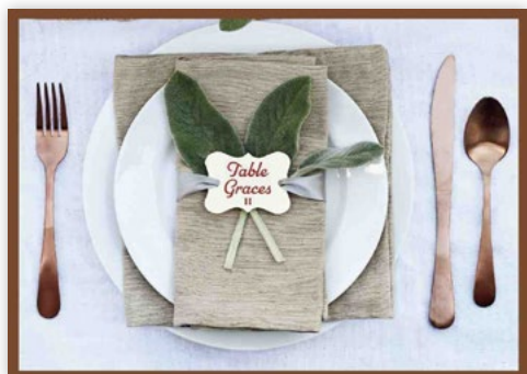
TABLE GRACES VOLUME II

This little booklet was compiled for use in our Christian homes, as we endeavor to nurture our children, and indeed, our entire families in the regular practice of table prayer. Designed to be folded and placed on the dining table, it is hoped that family members will take turns selecting a blessing to be offered at least once daily. The cost is $10 payable to CSUMC Spiritual Enrichment Fund.