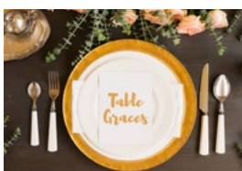
Table Graces Available

In an effort to remind families to pray together at mealtime, this helpful little booklet of table graces has been prepared by the spiritual enrichment team. Designed to sit upright on the dining table, adults and even small children can easily choose among the 42 prayers to offer gratitude regularly for God's provision. This handsome collection would make a fitting holiday gift or stocking stuffer and is available in the office or around the church. A donation of $5-10 is requested per booklet.