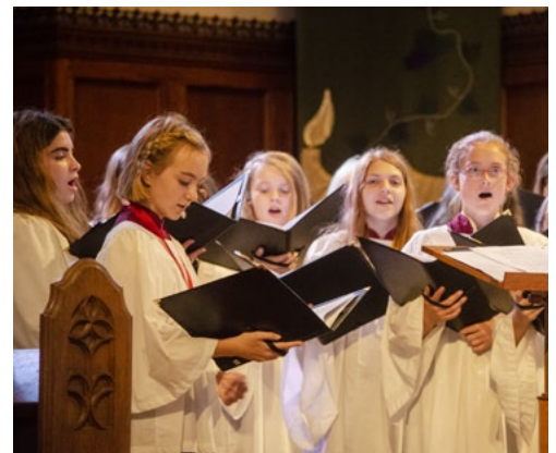
Service of Choral Evensong September 29, 2019