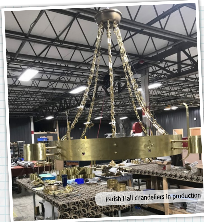
Parish Hall chandeliers in production