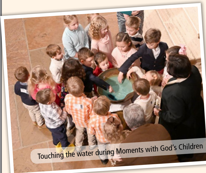
Touching the water during Moments with God's Children